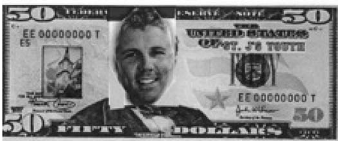
A sample of the money used at our auction night