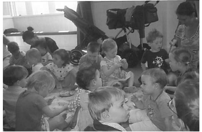
Toddlers have morning tea at Music & Movement