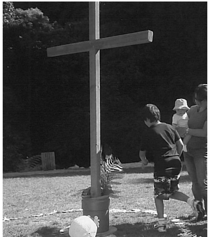
Picnic Church at the Troup Picnic Area at Otari, Wilton's Bush, March 2011