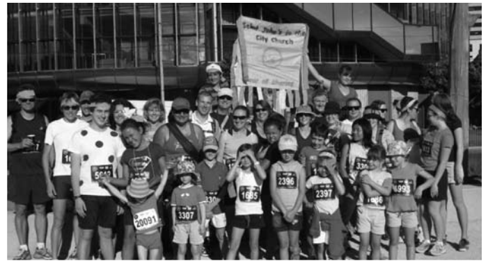
Round the Bays 2011