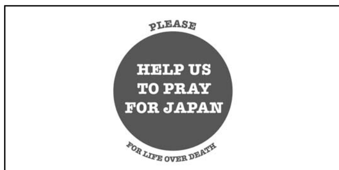
The signs which appeared on Willis Street after the Christchurch Earthquake and Japanese Tsunami