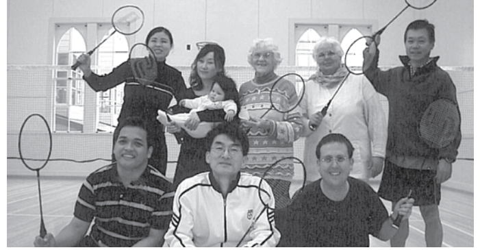
The Badminton and Table Tennis Club