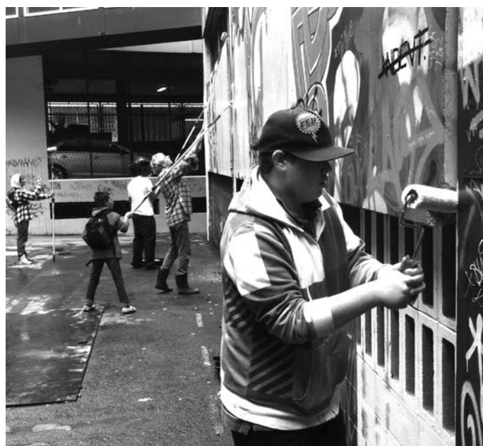
BGI artists paint a mural on Opera House Lane 2011