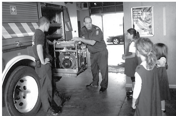
Fire Station visit