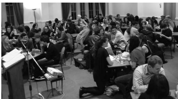
Over 100 people participate in the We *heart* Christchurch fund raiser quiz, organised by Link

With these two new key projects, we'd like to bring St Johns on board with BGI to work together in encouraging the boys to take the 'straight and narrow' path. In 2010 we were encouraged when the Session approved our request (with certain provisos) for the graffiti art boys to paint murals around the church site. Our intention was that they might feel a connection with a faith community through BGI.