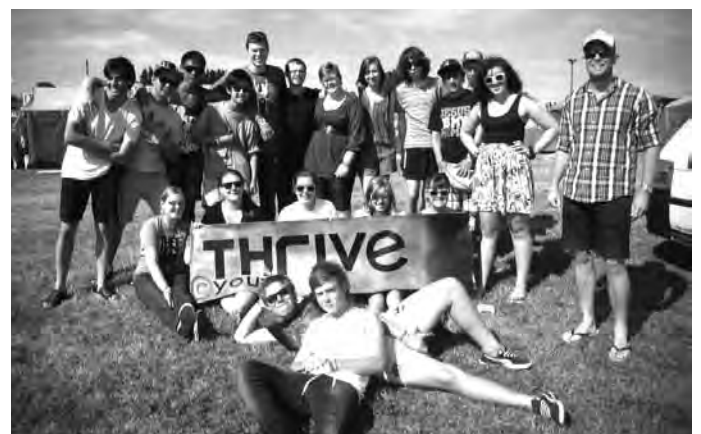
Thrive at Parachute 2012

The annual trip to Parachute Music Festival has become a part of the Thrive Youth staple diet. This event allows us to spend some quality time together as a youth group at the start of the year and to create memories that will last a lifetime.