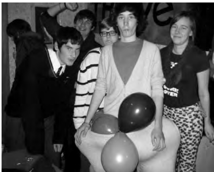
The Thrive Youth Pants Party

On this evening we joined forces with The Massive (Youth Ministry of the Street City Church) to bring the popular game/app to life. A great opportunity to create interconnected relations between youth ministries.