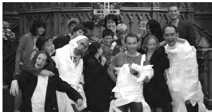
Epic looking at how the Church is the bride of Christ

We aim for a good mix of onsite and offsite activities, combined nights with Thrive, activities with St J's Kids, nights mixing with other youth groups, quitter nights, creative nights, run around nights, inventive nights and adventure nights. We work to the strengths of those in the leadership team and connect with the wider community to gain more skills when needed or when offered.