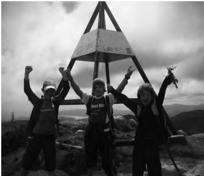
Juniors at the summit of Belmont Trig

We have had a small group of young men in Boys' Brigade, which has been growing in recent weeks. Some of the highlights of the year have been film-making, minigolfing, and swimming. In October we went tramping to the top of Belmont Trig. It was a long trek but a great view from the top. We had a lot of fun going geocaching around town (think orienteering with GPS).