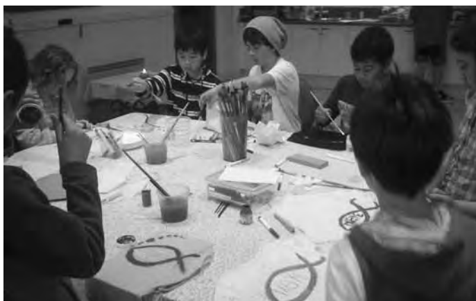
Crafty Time at Epic

This last year has been filled with many big adventures like creating a live drama skit for Starlight Storytime that was also made into a short film for JYMC's Regional Film Fest - all based on a children's storybook, "The Smartest Giant in Town". EPIC loved this as it gave them all different opportunities to grow and bring out their skills in different areas such as prop making, set dressing, editing, acting, narration, voice over, costume making, etc. It was hard work but a lot of fun.