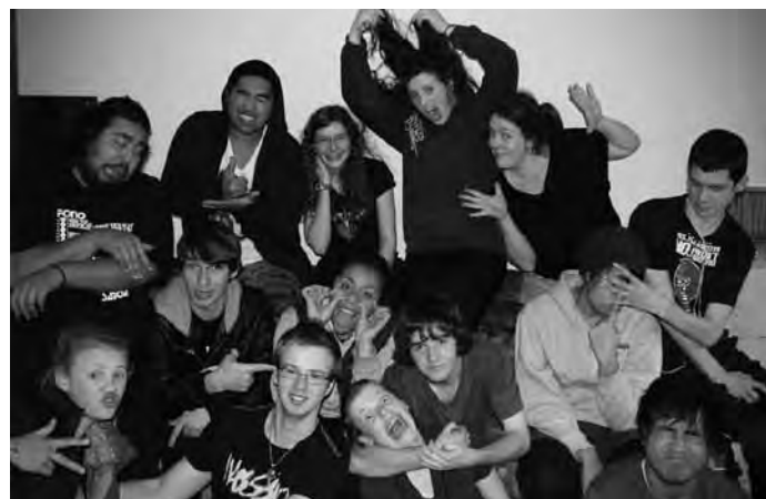
Young People from JYMC's Going Somewhere 2010 Leadership and Discipleship Course on Camp

This year, as in other years, our vision has been to reach out to as many young people as we can.