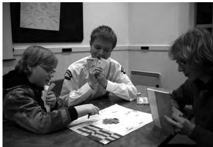
Seniors testing the board game they developed

In devotions we have been looking at parts of the Sermon on the Mount, and how we can pray to our heavenly father. The boys enjoyed discussing the themes of sacrifice around ANZAC Day.