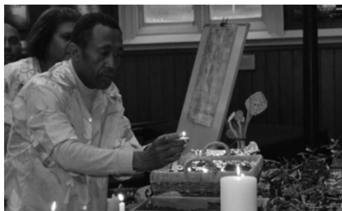
Aroha for Vanuatu, 19 April 2015.

The sacraments of Baptism and Communion are our practices of worship that ground us in the tangible grace of God. Baptism is the sacrament of welcome, and Communion is the sacrament of nurture. They both bring our faith to life as celebrations that are impossible for us to ever experience on our own.