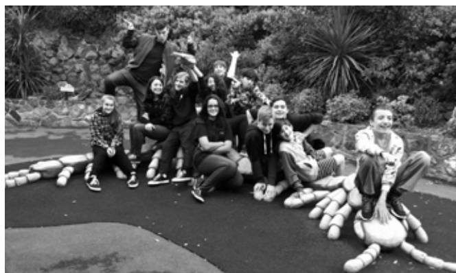
Fun at the zoo.

To end the year on a high note, both EPIC and Thrive groups had a sleepover at Wellington Zoo. The Zoo staff took us on a guided tour after hours where we were shown things you wouldn't normally see on a normal outing at the zoo. No one in the group had ever experienced this before and it was great to see what happens at the zoo behind closed doors.