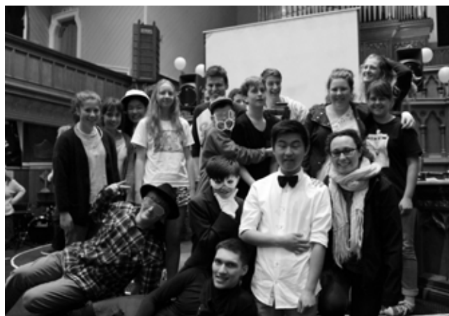
The winning Thrive Film Fest group.

St John's entries this year were very successful! EPIC celebrated third place once again with their film 'I'm so sorry' . And Thrive took away first place for the second year in a row with their hilarious film 'La faute à nos citrons' .