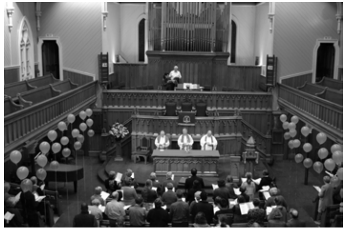
Combined Pentecost service, 24 May 2015