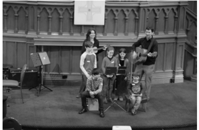
The Troughton family performing at the Musicathon.