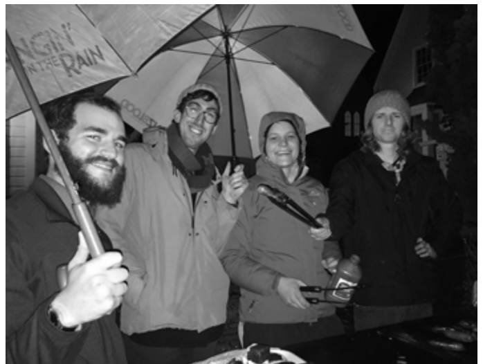
Evening servers doing their bit for Midnight Ministry.

St John's Evening Servers identified a critical need to fulfill: inebriated University students 'walking' down Dixon St en route to Wellington city during Victoria University Orientation Week (the week before University starts). And they acknowledged that something had to be done about it. So, with a little bit of baking from this person and that person in the congregation, some strong coffee, PB n Js, spag 'n cheese on toast, and some can-do attitude, a dedicated group of Evening Servers took to the entrance of St John's, between the hours of 10pm and 2am, and served our inebriated brothers and sisters. As exhausting as this type of outreach can be, it is incredibly life giving, and a pleasure for all involved. This ministry isn't possible without the generosity of the congregation: the baking, other donations, prayers, and support.