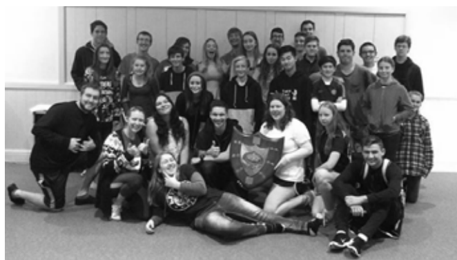
We've kept the NZ Presbyterian Young Men's Memorial Shield for another year.

We hosted Knox Waitara Youth group for a long Queen's Birthday weekend of competitive madness. The NZ Presbyterian Young Men's Memorial Shield, which had lain dormant for 78 years, and only recently been won back by Thrive, was once again up for stakes. After a fiercely close competition Thrive managed to retain the shield and keep it at St John's for another wee while. Until next time Knox. Thanks for all the baking St John's congregation!