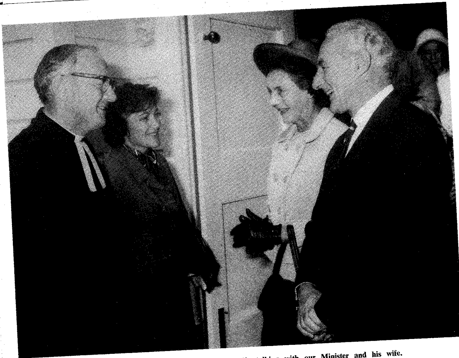
The new Prime Minister (Mr Marshall) and wife talking with our Minister and his wife.